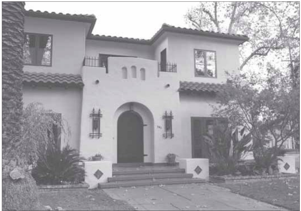
The second-floor addition to this East Sacramento home blends seamlessly